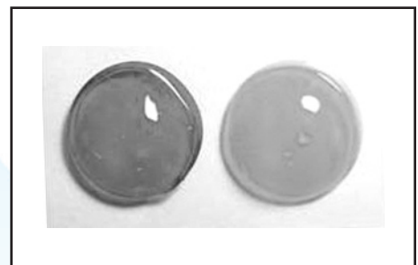
The left lens is in bathing solution without glucose; the right has glucose in bathing solution. The color of the lens changes as glucose in the solution changes. The starting color and sensing color can be varied for personal preference.